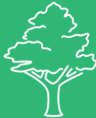
TUI FORESTS PROGRAMME