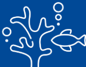
TUI SEA THE CHANGE PROGRAMME