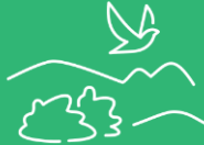
TUI WILDLIFE PROGRAMME