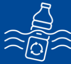
DESTINATION ZERO WASTE PROGRAMME