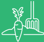
TUI FIELD TO FORK PROGRAMME